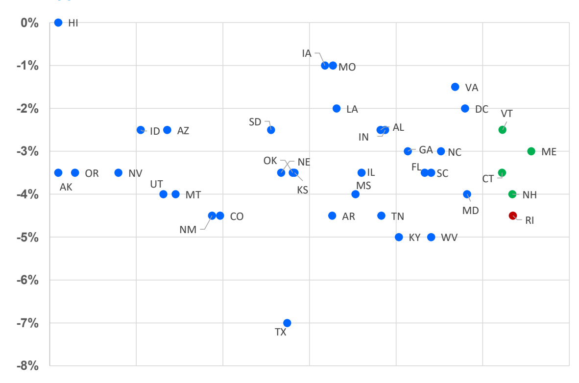
Chart 2: Comparison of Rhode Island Proposed Medical Trend Factor with Approved Trend Factors for All Other NCCI States

We also reviewed the 5, 6, 7, 8, 9, 10, 11, and 12-year goodness-of-fit statistics of the medical trend. In general, the data indicates a lower medical trend factor than -4.5%. The 7-year data fit had the highest goodness-of-fit statistic and this corresponds to a medical trend factor of -8.1%. Including additional years in the data fit generally implies higher medical trend factors but it also reduces the goodness-of-fit statistic. We note that a medical trend factor of -8.1% would be an outlier compares to other states.