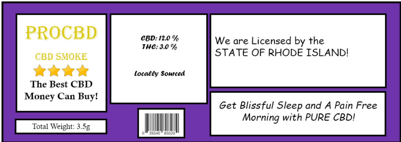
Unacceptable Form of Label

Improper comic sans and other unacceptable fonts, missing license number of producer and seller, missing ingredients, THC content exceeds 0.3% limit, has medical claims.