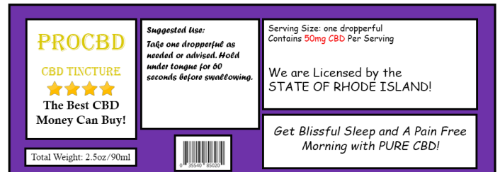
Poor Label: Improper font use, color font, missing license number of producer and seller, missing serving container, missing THC content, missing ingredients, has medical claims.